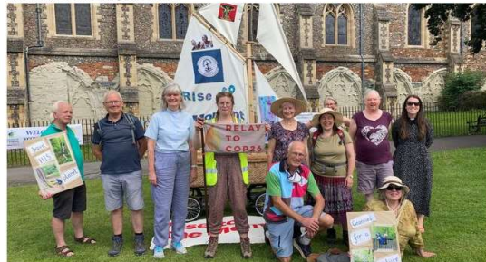
Members of the COP26 Relay at St Albans Cathedral.

The fight to save the planet from irrevocable climate change reached St Albans Cathedral this week.