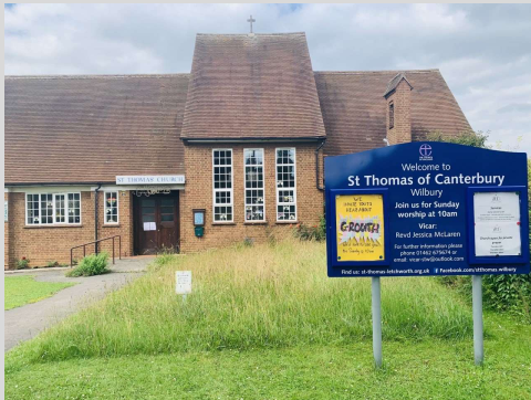
St Thomas of Canterbury, Wilbury, Letchworth